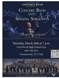
Click image to get your FREE Tickets