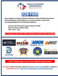
Click on image to learn more.