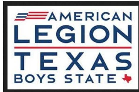
Click image for information and apply

Click on Image for information and to apply for Boys State.