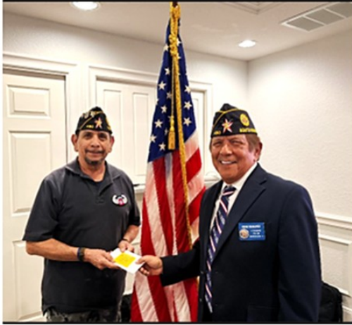
2nd Vice Commander presents the OSVC donation.

The American Legion Post 490 extends its heartfelt gratitude to the