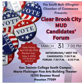
Click image to register